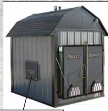
Dual Fuel Ready

Tested & Listed By O-T-L Beaverton Oregon USA C US OMNI-Test Laboratories, Inc.