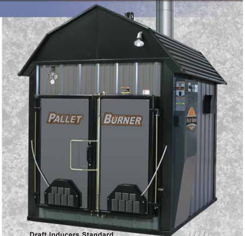
Draft Inducers Standard

Tested & Listed By O-T-L Beaverton Oregon USA C US OMNI-Test Laboratories, Inc.